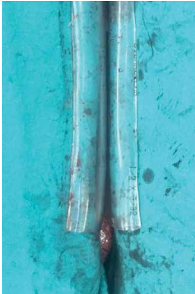
Figure 2. Prepared venous cannula lines are placed on the clothes.