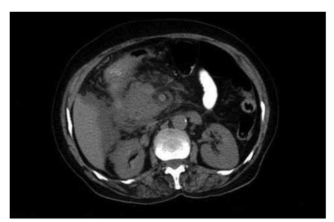
Figure 1. Abdominal contrast-enhanced computed tomography showing irregularity of the pancreas and pancreatic diffuse edema.